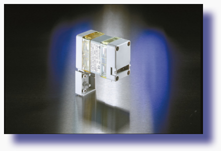
Star Elmatic - For Tilt Only Operation

Motors have VDE-Approval (230 Volts) and UL-Approval (110 Volts).