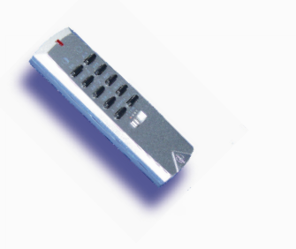
Accessories and Control Options

Trietex Compact for the comfortable operation of vertical blinds motorized by a 24 volts direct current motor. The motor is available with two different gears, the standard gear and the reinforced gear for heavy duty, which runs at half the speed of the standard gear. Independent of which side the motor was mounted, the tilting direction of the slats and the position of the stack can be adjusted and inverted by dip-switches. The end positions can be easily adjusted with buttons on the lower side of the motor. An integrated current protector preserves the motor against mechanical or thermal overload.