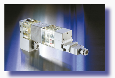
Star Elektra - The Project Choice

Whenever it comes to a solid solution for motorizing vertical blinds -Trietex' Star Elektra System sets the standards. Consisting of a brushless 230 Volt synchronous motor in combination with two rods for tilting and traversing it allows smooth, silent and reliable operation even of heavy draperies.